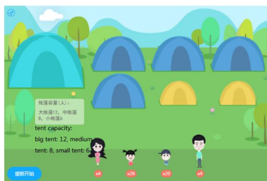
Figure 4. Screenshot of test item 3: “Tent assignment”

In the last task, students are told that they can only resupply their food and water at the end of each day during their camping trip; therefore, they need to calculate how much food and water they should prepare for each day. The materials center provides the corresponding documents that describe how much food and water an adult usually needs to consume daily. The students must obtain this information to solve the problem. In contrast to the first test item, the students need to type their answer. Because the answers are specific numbers, they can be easily graded automatically.