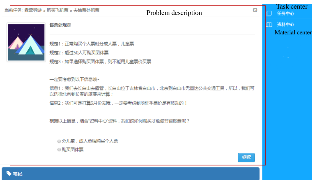
Figure 1. A sample test item (test item 1)

To support the structure of the test items, the system provides some common functionalities and utilities. To allow students to access the relevant materials conveniently, a navigation bar is placed at the right-hand side of the area where the test items are displayed (Figure 1). All associated materials for the current assessment task are stored in the component, “materials center,” which is located in the navigation bar. The materials center contains not only the relevant materials but also some irrelevant ones. Therefore, the follow-up data analysis could reveal how students chose different materials. As soon as a student clicks on the materials center, a new window pops up that shows a list of the materials (Figure 2, left). Each entry in the list shows both the title and a brief description of the document. When a student clicks on the name of the document, its details are displayed (Figure 2, right). The student can click on the back button to return to the list panel and access other materials. Students can also close the materials center whenever they want by clicking on the close button. High-achieving students are supposed to be very clear about what they are looking for and can thus locate the relevant document quickly. By comparison, low-achieving students could flounder and may randomly access many irrelevant documents. As soon as the students finish a test item, they can proceed to the next one.