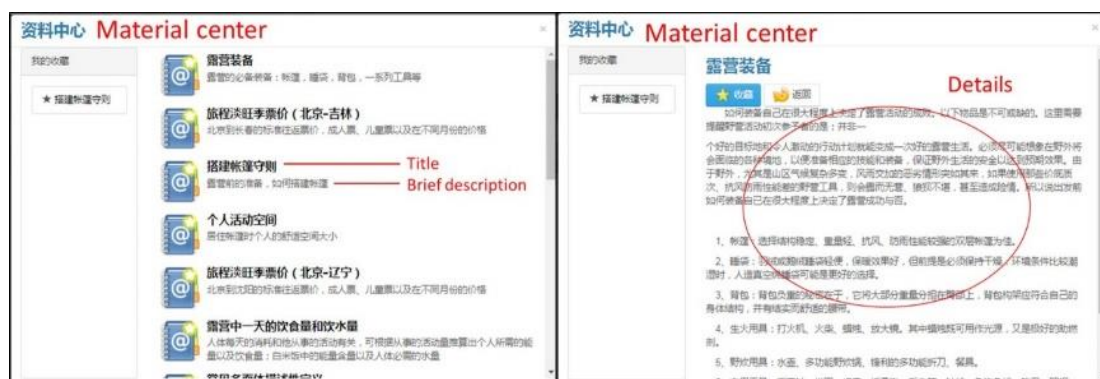
Figure 2. Materials center: List of materials (left) and contents of a single item (right)