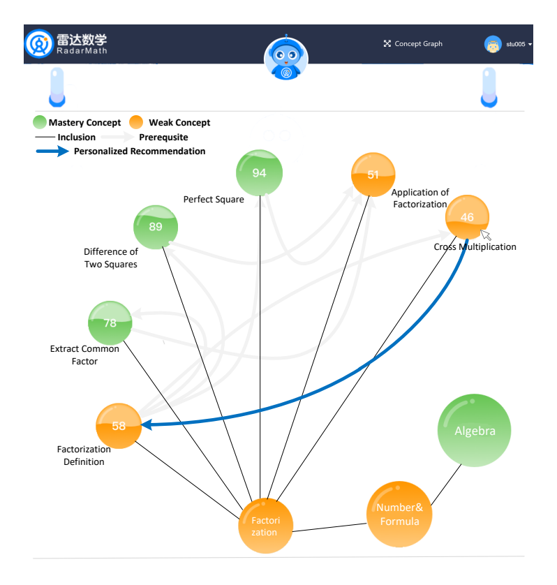
Figure 3: An Education-Oriented Knowledge Graph

The grading process is the traversal process of the PST, as its nodes is used to measure the equivalence between learner's answer and the reference expressions. Eventually, the stackbased grading model would give the score and feedback on any answers in the form of formula.